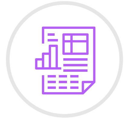
Renewable Energy Consumption & Production Report