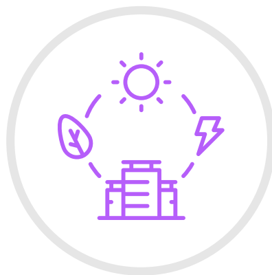
Monitor Renewable Energy Distribution